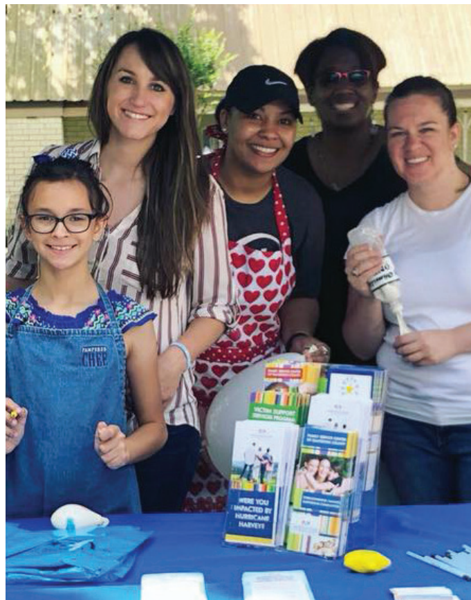
In school settings and at community recovery fairs, Red Cross grantee Family Service Center of Galveston County provides mental health and counseling services for children and families recovering from the trauma of Hurricane Harvey.

Rebuilding isn’t the only need for disaster-impacted communities — counseling and mental health services are also a key aspect of recovering from a devastating event like Harvey, especially for children. Enter the Family Service Center (FSC) of Galveston County, whose mission is to promote mental health and well-being through education, counseling services and prevention.