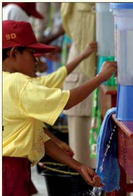
American Red Cross programs teach healthy hygiene behaviors such as washing hands before eating.

In five districts of Indonesia's Aceh province, including districts on the islands of Pulo Aceh and Pulo Weh, the American Red Cross and Indonesian Red Cross Society are providing new and restored wells, latrines, drainage piping and wastewater treatment facilities that will reach more than 65,200 people in rural and urban communities. Similarly, the American Red Cross and Sri Lanka Red Cross Society (SLRCS) are working in Matara and Hambantota districts of Sri Lanka to repair or construct new wells and install new toilets that will ultimately provide approximately 19,600 people access to potable water and healthy sanitation.