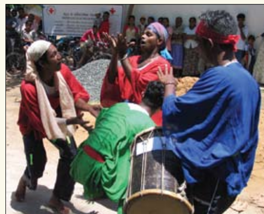
Sri Lankan students perform a hygiene promotion drama to inform the community of how they can help prevent the spread of disease.