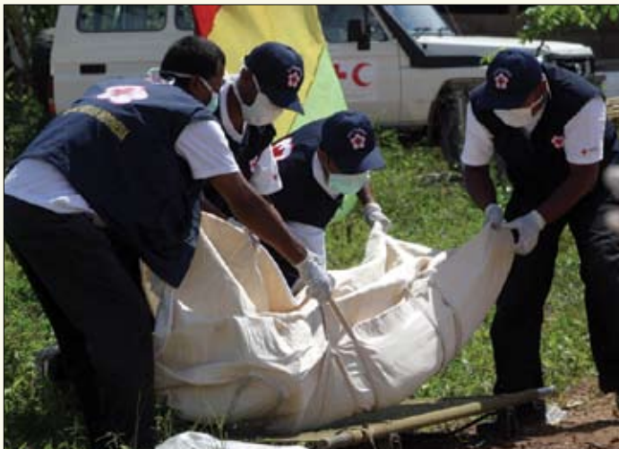
Indonesian Red Cross workers participate in a disaster drill.

In the tsunami-affected provinces of Thailand, the American Red Cross is supporting disaster preparedness projects in coordination with the Thai Red Cross Society (TRCS) and the International Federation. The American Red Cross will integrate its programming to complement the TRCS' role in Thailand's national disaster management plan and to raise public awareness of disaster preparedness through community-based education.