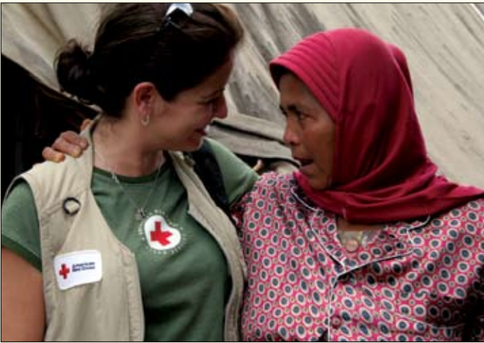
An American Red Cross worker provides comfort to an Indonesian woman.

The revised strategy continues to maximize community participation with American Red Cross efforts at all stages of program planning and implementation. This approach guarantees accountability to beneficiaries and fosters good stewardship of donated funds. Similarly, regular sharing of information with partners and donors helps to ensure that the American Red Cross is better equipped to continue meeting survivors' needs, while spending donated funds efficiently and effectively.