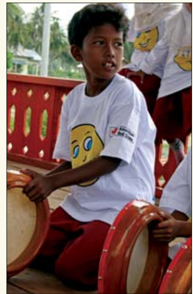
Making music is one way psychosocial programs help children heal.