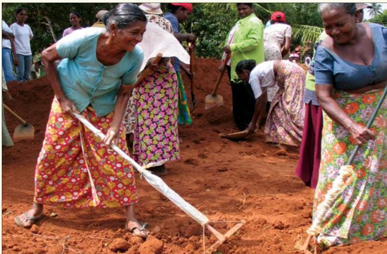
Women working on an American Red Cross cash for work project in Matara, Sri Lanka.