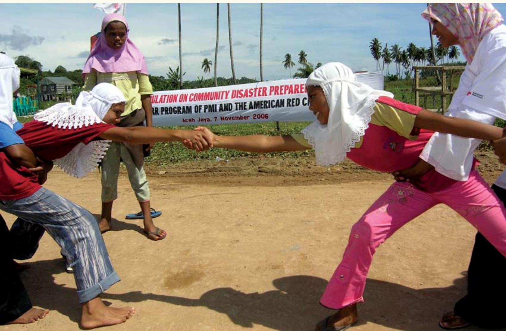
Girls practice lifesaving techniques that could help prevent the loss of life in future disasters.