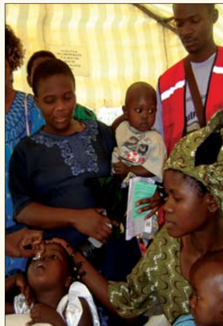
A Kenyan girl receives vitamin A drops during an integrated health campaign to help strengthen her resistance to disease.