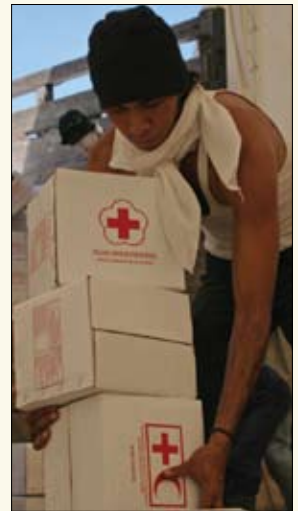
A Red Cross worker unloads relief supplies.

The remainder of this report describes some of the American Red Cross long-term programs underway or planned for the coming years to assist survivors and their communities. For additional information and updates on activities, please visit www.redcross.org/tsunami .