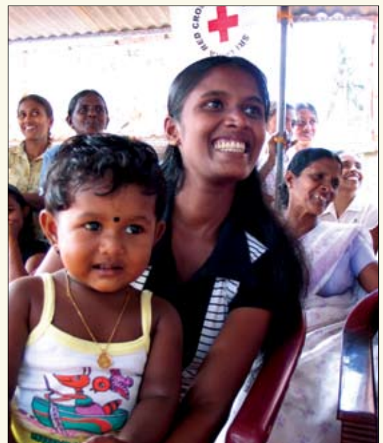
A Sri Lankan woman and child watch a psychosocial support program.

The American Red Cross, working through the ICRC in Sri Lanka, is assisting the SLRCS to strengthen its capacity to provide such tracing services. Through this effort, SLRCS volunteers from every district across the country receive basic training to handle tracing requests and restore family links for those separated by disaster, migration or conflict. In the current conflict situation in the country’s north and east, SLRCS volunteers are using their new skills to help conflict-affected families exchange urgent family news.