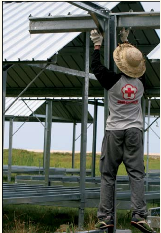
An Indonesian Red Cross worker constructs a steel-framed, transitional shelter.

Furthermore, the American Red Cross is funding housing efforts in Indonesia and Sri Lanka through its partnership with the International Organization for Migration (IOM). The construction of more than 1,800 transitional and permanent shelters, including community buildings, will assist approximately 11,000 internally displaced persons in Aceh province.