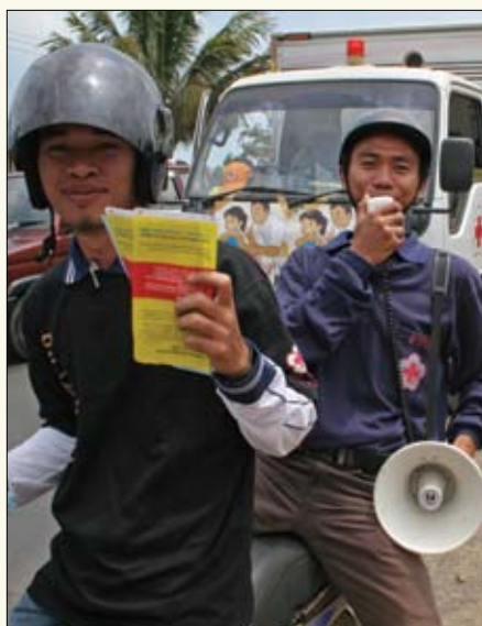
Indonesian Red Cross workers spread the word about an upcoming measles campaign.