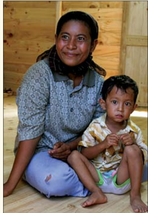
An Indonesian mother and child sit in their new transitional shelter.