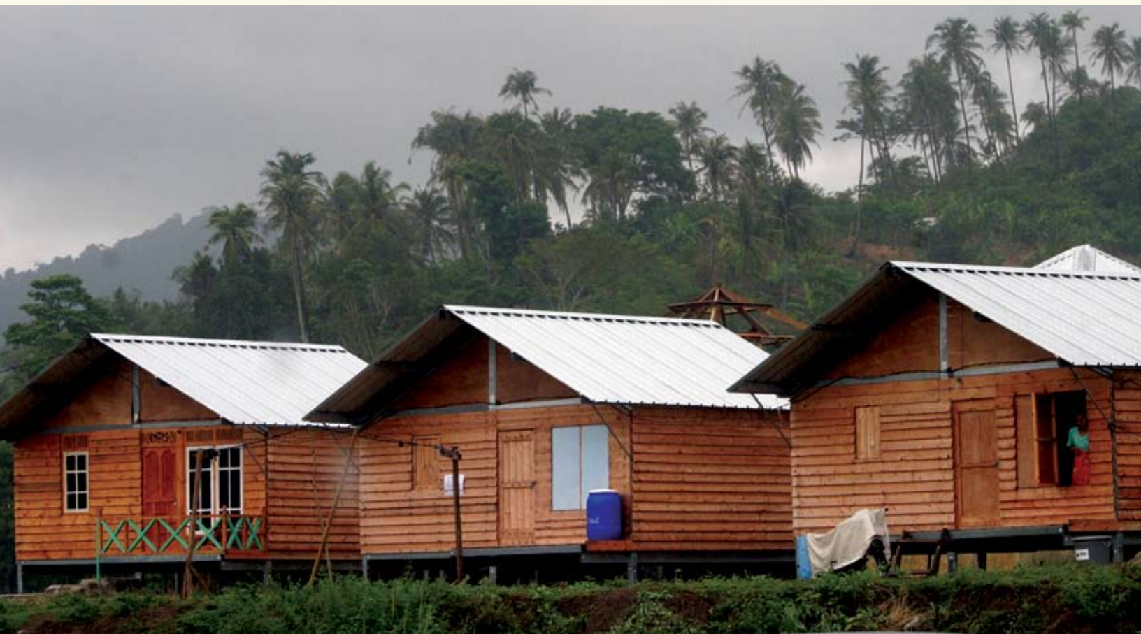
Families in Pulo Weh, Indonesia, live in these transitional shelters.

WWF also wrote “Green Reconstruction Policy Guidelines” as a road map to recovery and a guide for managing the consequences of natural disasters shortly after the tsunami. The American Red Cross uses this guide to plan, carry out and evaluate its recovery projects. Through this approach, the American Red Cross and WWF aim to ensure a long-lasting recovery that protects the environment and strengthens communities for years to come.